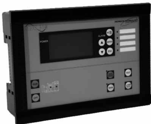
MEC 310 CONTROLLER