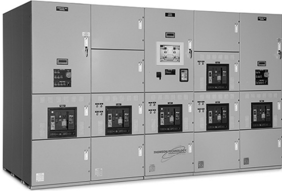
TYPICAL SERIES 2400 MULTIPLE GENERATOR/UTILITY PARALLELING SWITCHGEAR