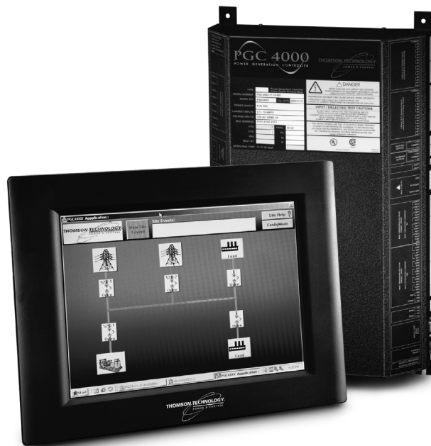
PGC 4000 CONTROLLER & SYSTEM OPERATOR INTERFACE

One controller is required for each generator set. Only one operator interface display is required for the complete system.